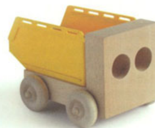
Left to right: Sam Johnson/TEN/ twentytwentyone/Crafts Council, Dumper , 2008. Photo: Héctor Serrano Tomoko Azumi/TEN/ twentytwentyone/Crafts Council, Transport Lamp , 2008. Photo: Héctor Serrano