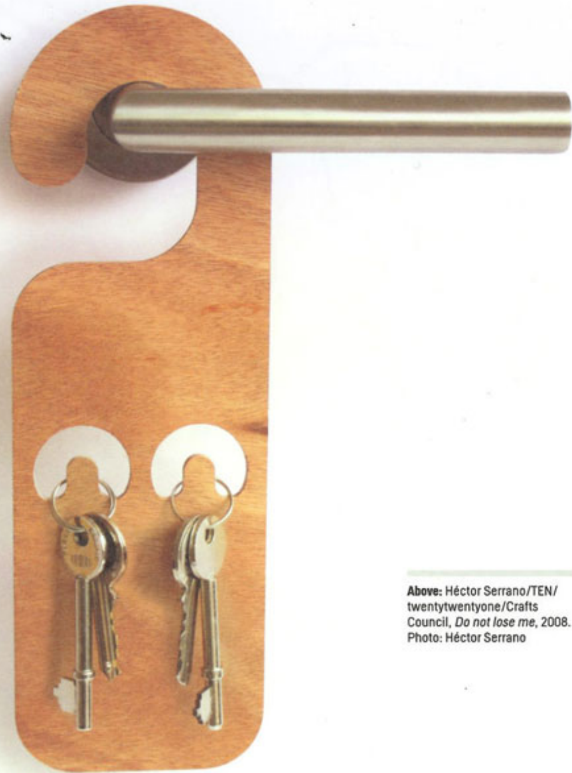
Above: Héctor Serrano/TEN/ twentytwentyone/Crafts Council, Do not lose me , 2008.

Héctor Serrano, and the objects that were produced illustrated ten varied approaches to sustainable design that were ripe with humour and intelligence.